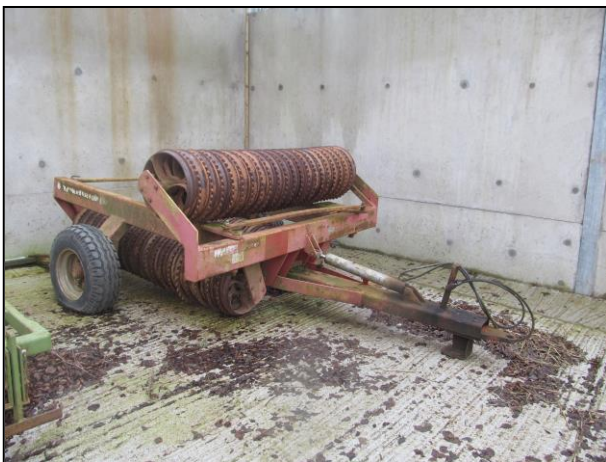
Ransomes Fold up Roller