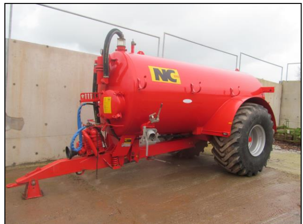
NC2050 Slurry Tanker