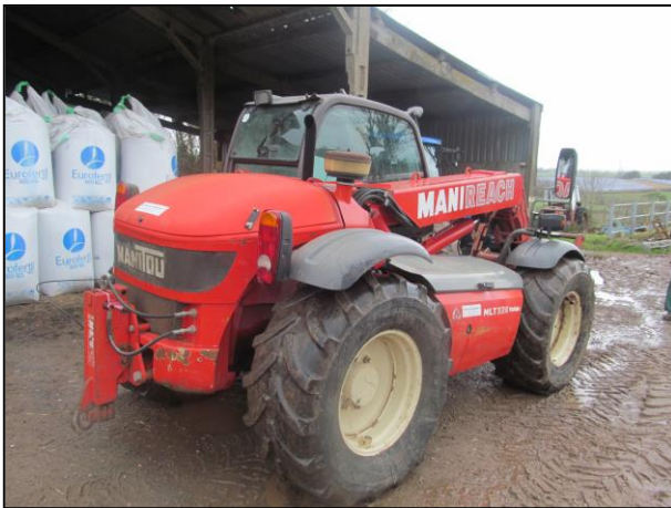
Manitou MLT526 Turbo