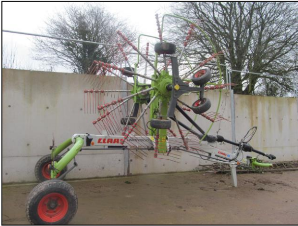
Claas Liner 2600 2 Rota Rake