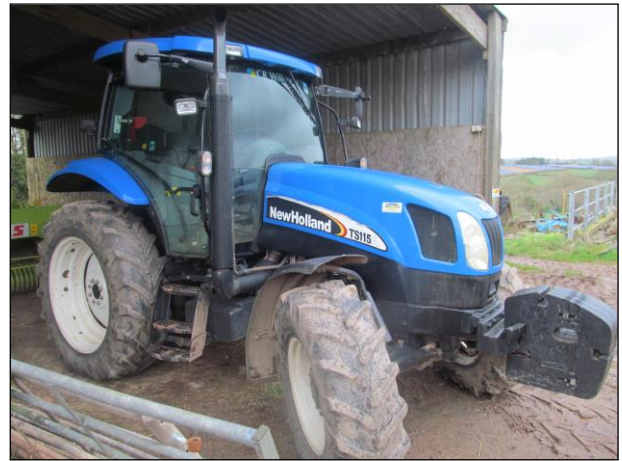
New Holland TS115A 4WD Tractor