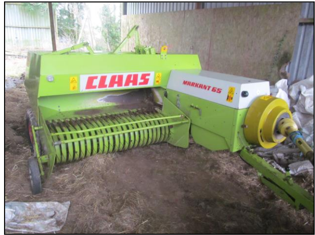
Claas Markant 65 Square Baler