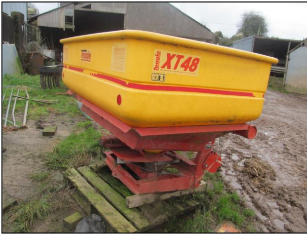
Teagle X48 Fertiliser Spreader