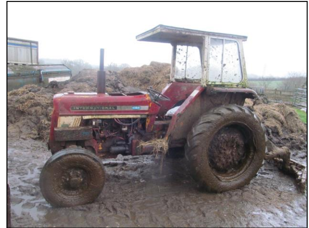
International 454 Tractor