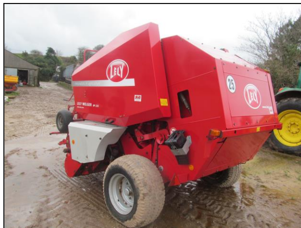
Lely Welgar RP235 Round Baler