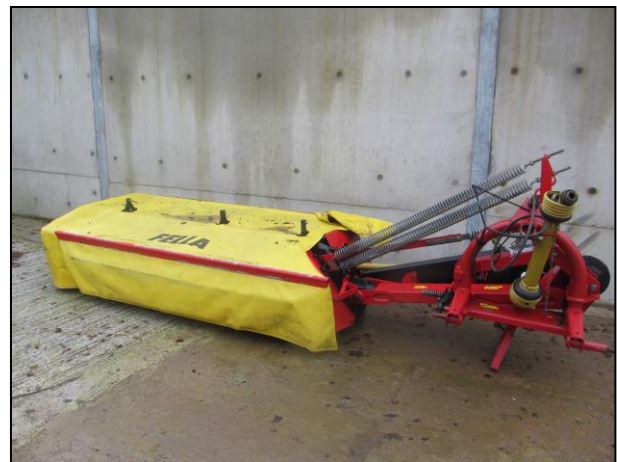
9' Fella-Werke 2010 Mower Conditioner