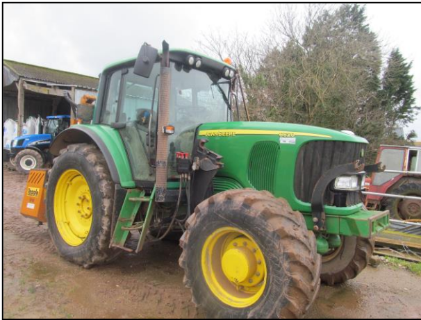
John Deere 6620 4WD Tractor