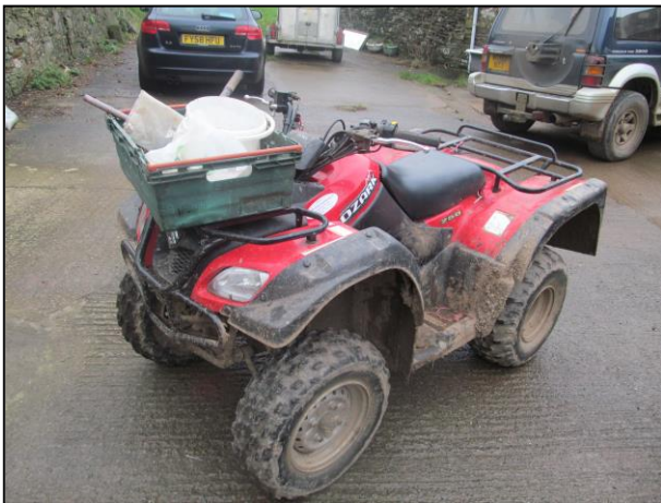
Suzuki Ozark Quadrunner 250