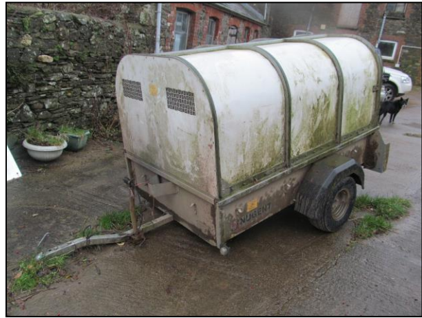
Nugent 6' x 4' Trailer