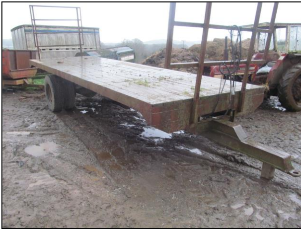
Bale Trailer with lades